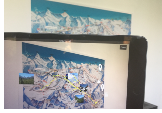
Figure 2. SkiAR app running on a tablet computer

We use a smartwatch as the SkiAR input device. The watch is wirelessly connected to a smartphone in host mode. However, a more realistic input device may be a dedicated wristband controller. Figure 3 gives an example of the watch user interface in SkiAR. The user can control information presentation using a small set of swiping gestures. Figure 3a corresponds to the information presented to the user on Figure 2, where all available virtual objects can be seen in a single view. However, users can