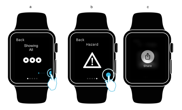
Figure 3. SkiAR input interface on a smartwatch.

filter and display only one type of objects at a time, e.g., only "Hazards" as indicated in Figure 3b. Additionally, it is possible to add new objects to the system using the watch interface (e.g., encountered in-situ hazards). In this mode, the system reads the current GPS position of a skier and registers a new item at this position. Finally, the host of a session can share any content category with other skiers in the group by applying a touch gesture while in the appropriate category and pressing "Share" (Figure 3c). The SkiAR system will then update the corresponding information for all followers automatically.