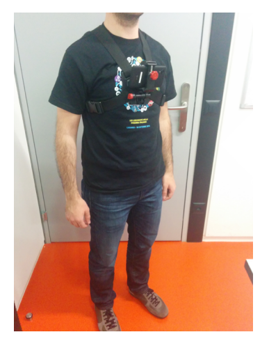
Position of the setup on a runner

audio) the experience of a run and "re-live" it later by reviewing it in the form of a short multimedia presentation. We then conducted a pilot study with 10 participants in order to understand the actual use of the prototype. Following the results from Biondolillo and Pillemer, our hypothesis is that participants that had the ability to re-live and hence recall their previous run sessions will engage in more subsequent running activities. In this workshop paper we describe the mobile prototype for recording different activities including run exercises and report on the pilot study.