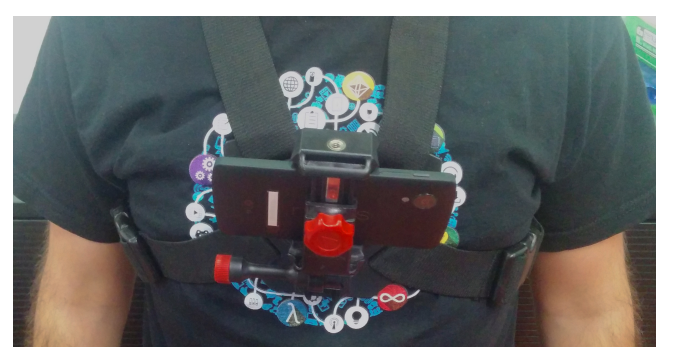
Figure 1: Chest mount with smartphone strapped in