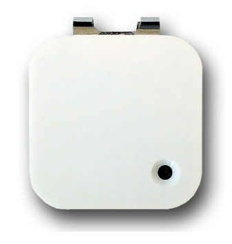
Figure 4: Narrative Clip - wearable camera

Naturally, from open-ended questions in the final questionnaire, we concluded that those participants who shared the film have also provided some ideas how to engage co-located and remote users into a post-run review session. As Ojala suggested in his study of online sport communities, shared content could be a powerful tool to strengthen social ties [9]. A live tracking feature on a map, and the ability to discuss a run with others were among top suggestions from our members to improve on the social interaction while reviewing their workouts.